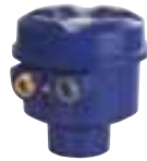
Aluminium housing, flameproof design