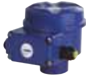
Aluminium housing, flameproof design with increased safety