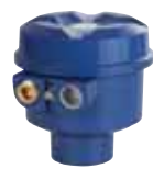
Aluminium housing, flameproof design