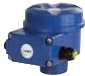
Aluminium housing, flameproof design with increased safety