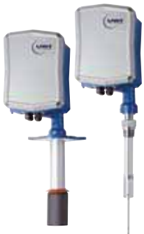
NB 3100 Rope version