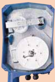
View rope/tape chamber