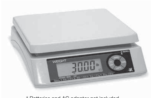
* Batteries and AC adaptor not included