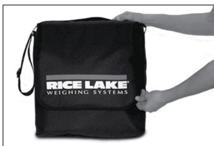
Transport/Carrying Case for Floor Level Scale